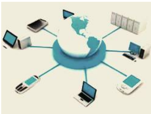
Fig. 1 Cloud Computing

The definition of Cloud Computing according to NIST, "Cloud computing is a model for enabling ubiquitous, convenient, on-demand network access to a shared pool of configurable computing resources (e.g., networks, servers, storage, applications, and services) that can be rapidly provisioned and released with minimal management effort or service provider interaction. This cloud model is composed of five essential characteristics, three service models, and four deployment models" [1].